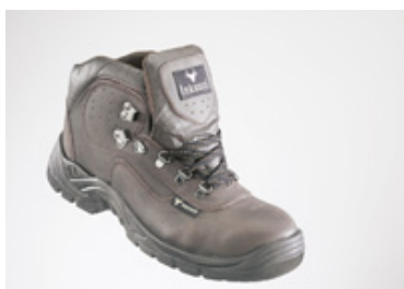
INKUNZI BOOTS. Style 6503 - Brown Full Grain Leather (Oily), Steel Toe