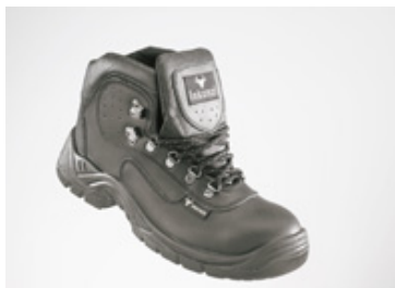
INKUNZI BOOTS. Style 6502 - Black Full Grain Leather (Oily), Steel Toe Cap (200J), PU Sole, Padded Collar, 250gsm Vamp Lining, 180gsm Foam Laminated Cambrola, Oil & Acid Resistant, Anti-Static, Dual Density