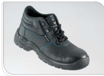
INKUNZI BOOTS. Style 6509 - Black WITH META GUA RD Leather Upper, Steel Toe Cap, PU Sole, * Metaguard Sold Separately Oil & Acid Resistant, Blue Sticthing, Anti- Static, Dual Density