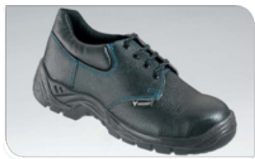
INKUNZI SHOES. Style 3307 - Black Leather Upper, Steel Toe Cap, PU Sole, Oil & Acid Resistant, Anti-Static, Dual Density