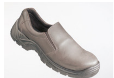
INKUNZI SLIP-ON SHOES. Style 3301 - Brown CG Leather, Steel Toe Cap (200J), PU Sole, Slip-on, Oil & Acid Resistant, Anti-Static, Dual Density