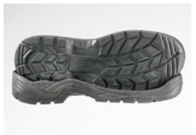
INKUNZI SOLE - Black