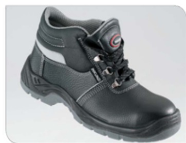
INKUNZI BOOTS. Style 6501 - Black Full Grain Leather, Steel Toe Cap 200J, PU Injection Sole, Oil & Acid Resistant, Anti-Static, Dual Density