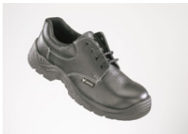
INKUNZI SHOES. Style 3300 - Black Full Grain Leather, Steel Toe Cap 200J, PU Injection Sole, Oil & Acid Resistant, Anti-Static, Dual Density