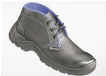
INKUNZI BOOTS. Style 6505 - Black Leather Upper, Steel Toe Cap, PU Sole, Light Weight, Blue Collar, Oil & Acid Resistant, Anti-Static, Dual Density