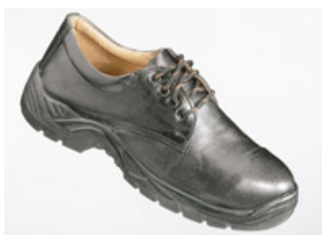
INKUNZI UNIFORM SHOES. Style 3308 - Black