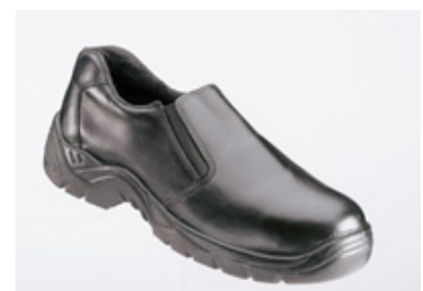
INKUNZI SLIP-ON SHOES. Style 3301 - Black