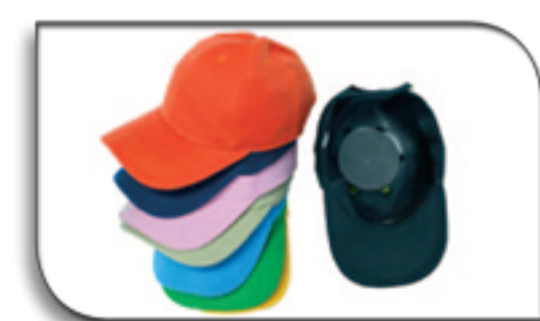
Bump Cap with padded inner