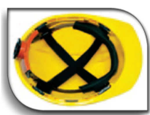
Hard Hat Inner