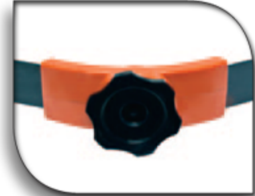
Hard Hat ratchet system