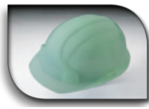
Luminous Hard Hat